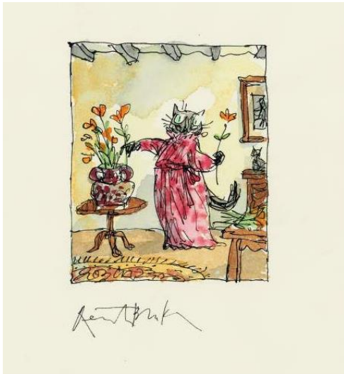
Quentin Blake, Kitty-in-Boots, or, Miss Catherine St Quintin , pen, ink, watercolour, watercolour paper, signed, estimate: £1,200-1,800

Chocolate Factory , The Twits , and James and the Giant Peach to David Walliams's Mr Stink . Alongside these cherished children's stories, the sale presents collectors the opportunity to acquire works from various other projects that Blake has worked on including editions illustrated for The Folio Society and artwork for J Sheekey Restaurant, along with illustrations for various public spaces, such as St George's Hospital, Tooting and the Maternity Unit at Angers University Hospital in France.