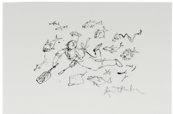
Quentin Blake, The Chef , pen, ink, watercolour paper, signed, 195 x 280mm, estimate: £300-500

Alternative aspects of Blake's work will be explored, including a group of pencil drawings from his exhibition Arrows of Love , depicting women avoiding or embracing Cupid's arrow. These rarely-seen nudes reveal Blake's personal reflections on the joy, folly and sorrow of love. Further illustrations presented in the sale include his work for the Atlantic Bar at J Sheekey restaurant in London, portraying J Sheekey's chefs, sommeliers and patrons swimming among shoals of fish and sea-creatures. The under-the-sea theme is a particular favourite of Blake's and is continued in the auction with drawings from the Jerwood Gallery's exhibition in 2015 'Life under Water: A